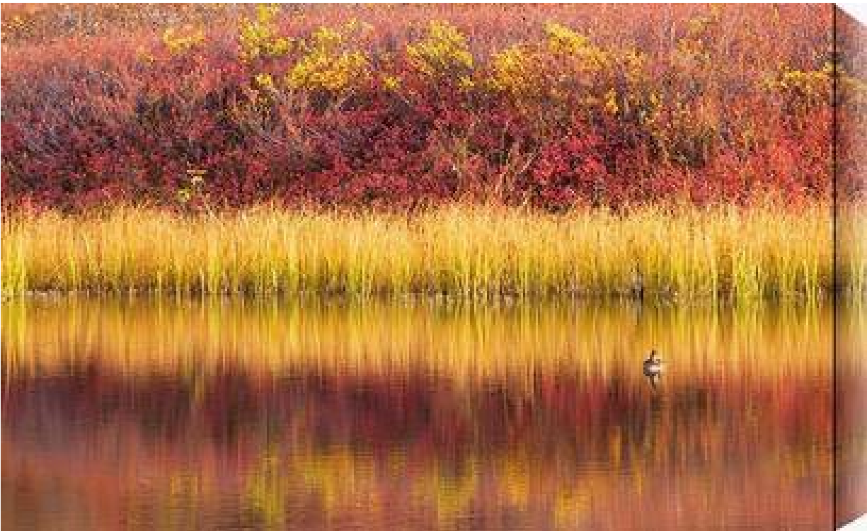
Fall Reflections Canvas