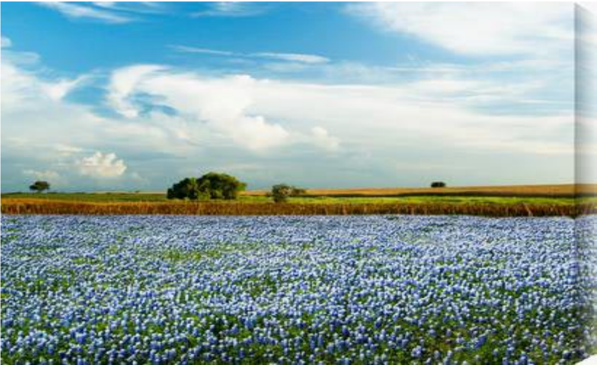
Bluebonnet Field Canvas Size: 65w x 44h