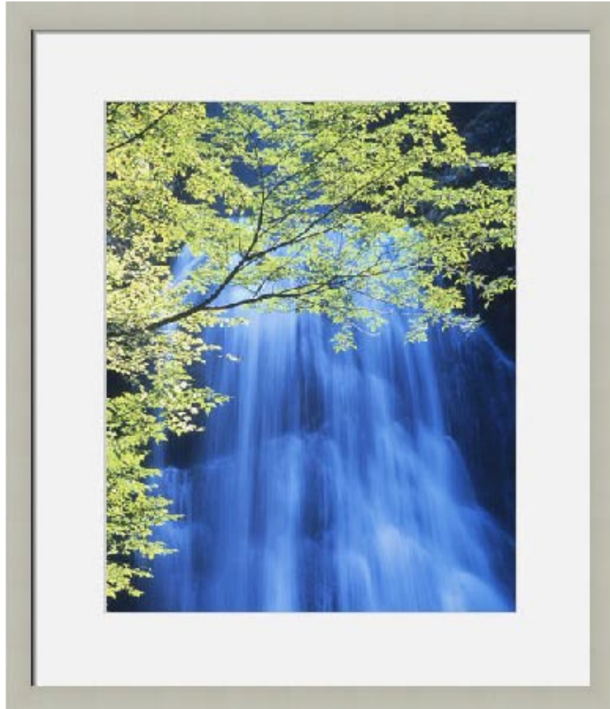
Waterfall (Reception Left Wall) Size: 22w x 34h