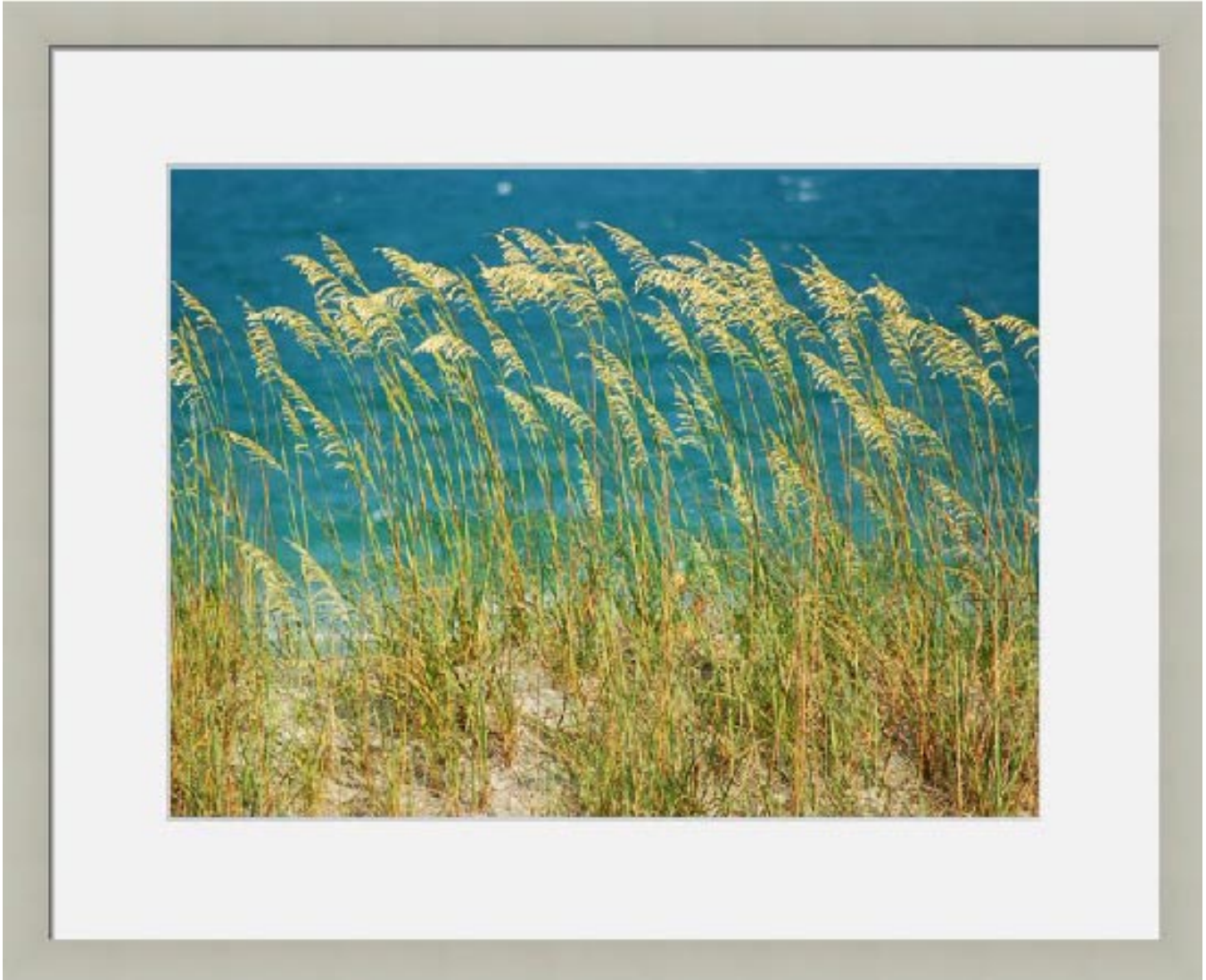
Conn. Shore Size: 22w x 30h