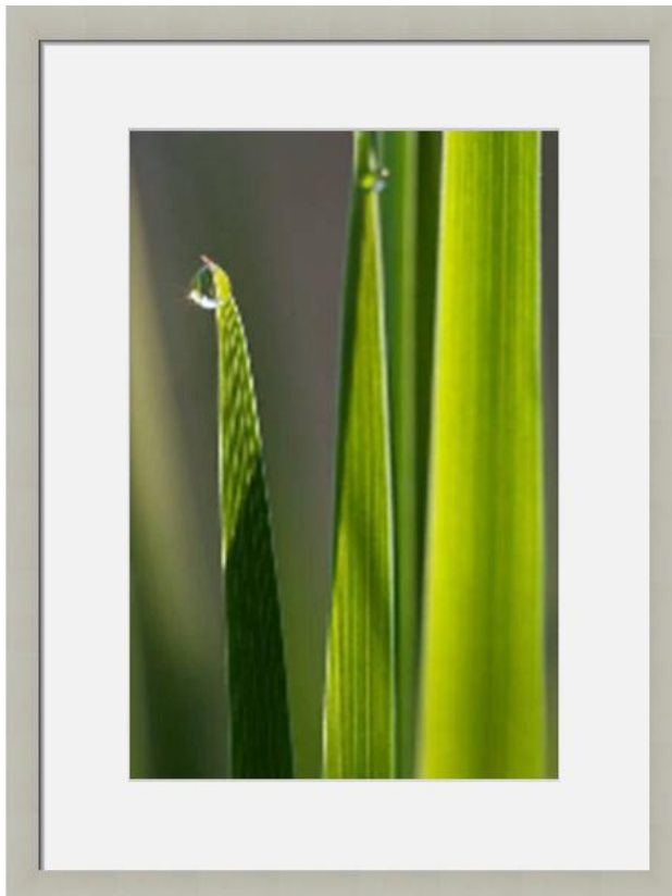
Dew Drops II Size: 22w x 30h