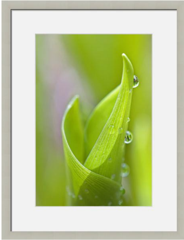
Dew Drops Size: 22w x 30h