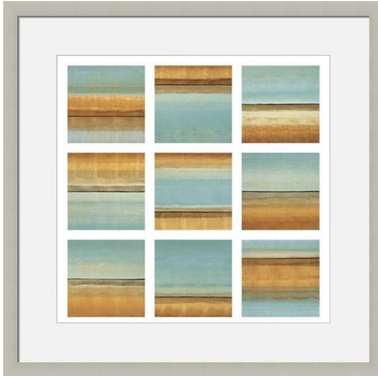
Squares (End of Hallway) Size: 38w x 38h