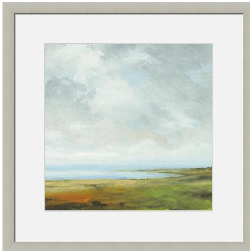
Storm Series II Size: 20w x 20h

1266 East Main Street, Suite 700 Stamford, CT 06902 Ph : 203-977-8203 Fx: 203-274-8817