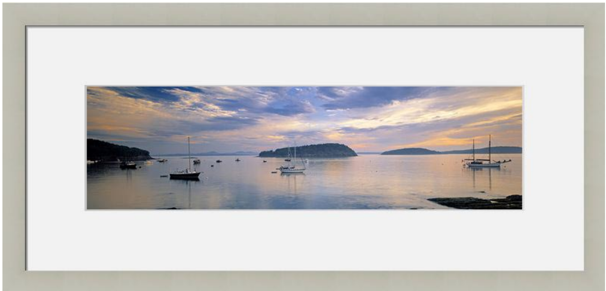
Conn. Harbor (Copier Wall) Size: 60w x 29h