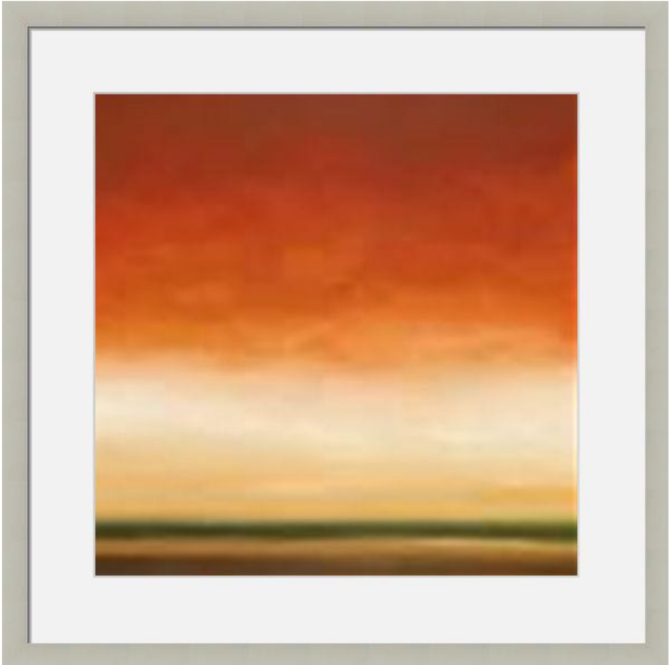
Evening Size: 36w x 36h