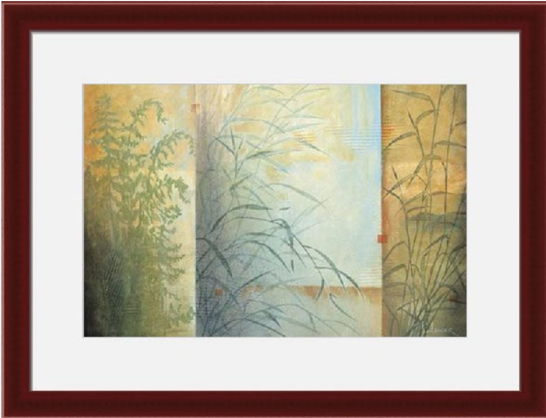
Ferns & Grasses Size: 40w x 30h