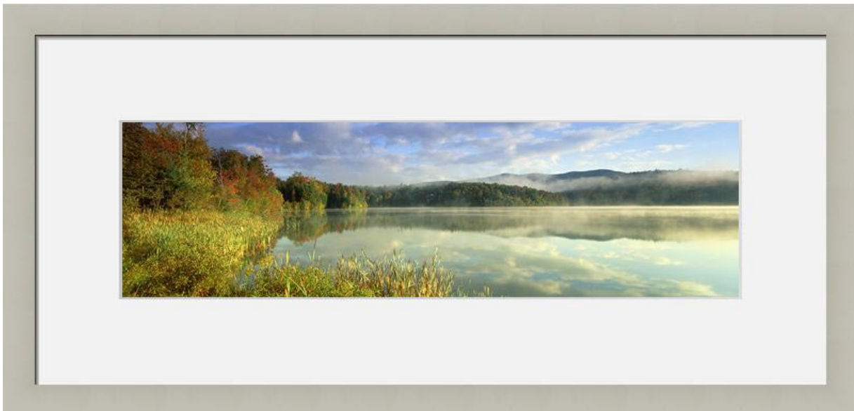
Conn. Morning Mist (Reception Side Wall) Size: 54w x 25h