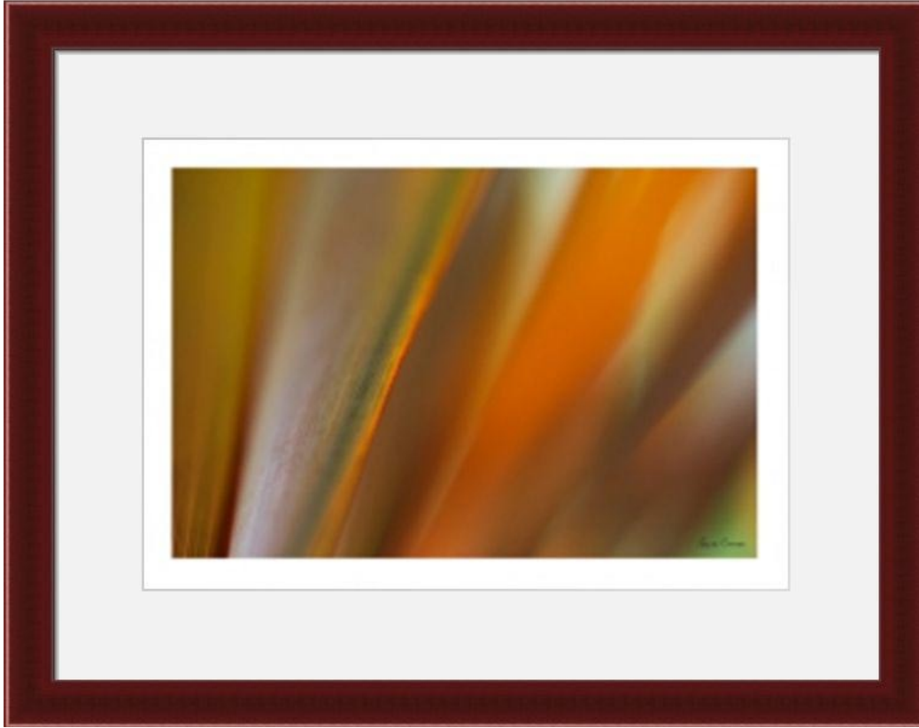
Abstract I Size: 40w x 30h