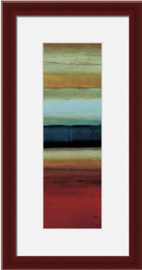
Color Shift I Size: 18w x 40h