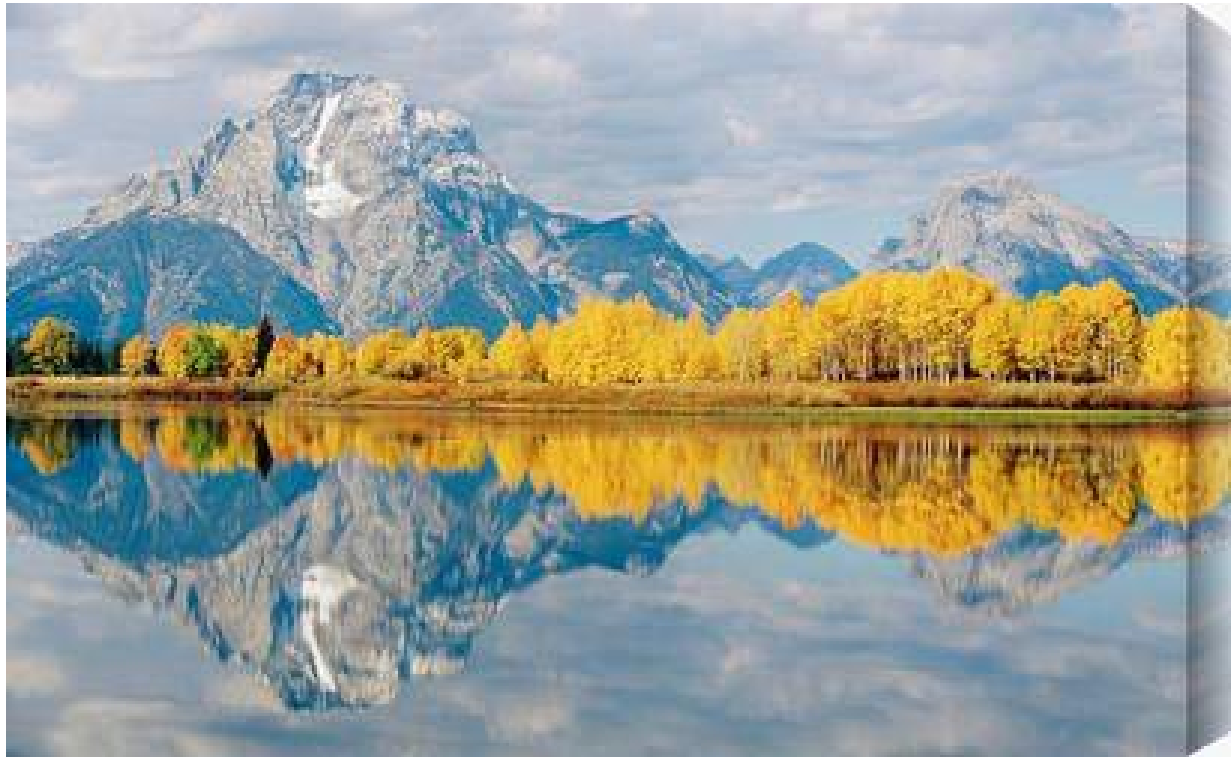
Mount Moran Canvas