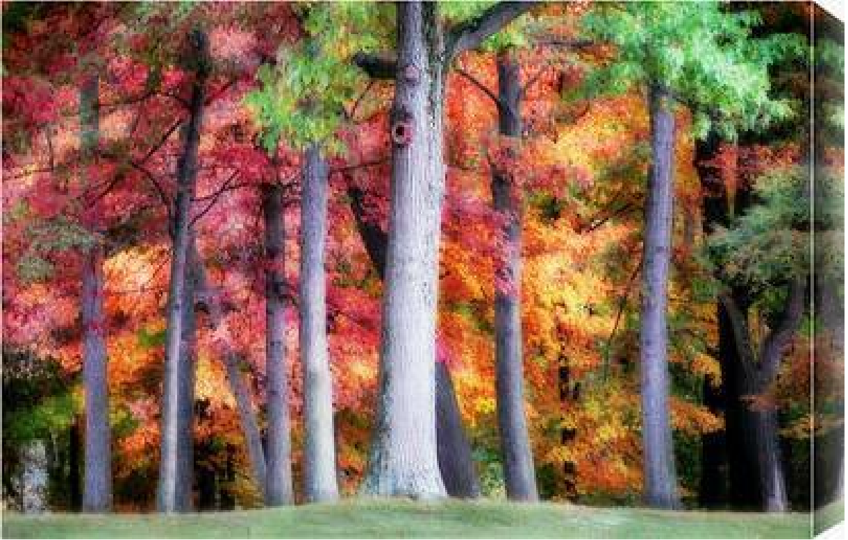
Autumn Colors Canvas