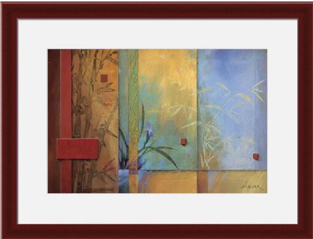
Spa Dreams Size: 40w x 30h

Ph : 203-977-8203 Fx: 203-274-8817 1266 East Main Street, Suite 700 Stamford, CT 06902