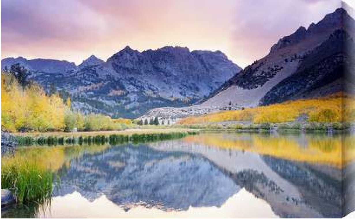
Mountain Reflections Canvas