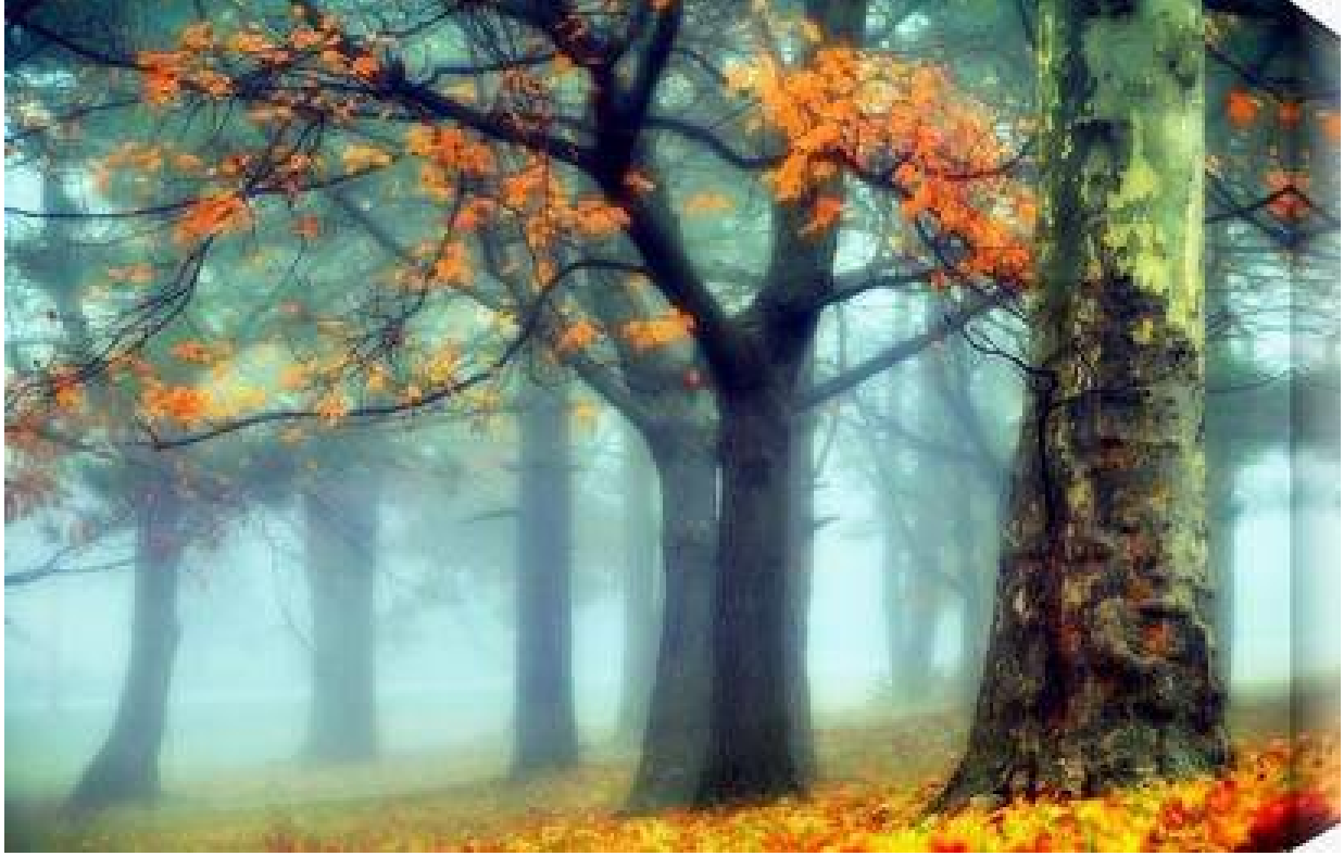
October Gold Canvas