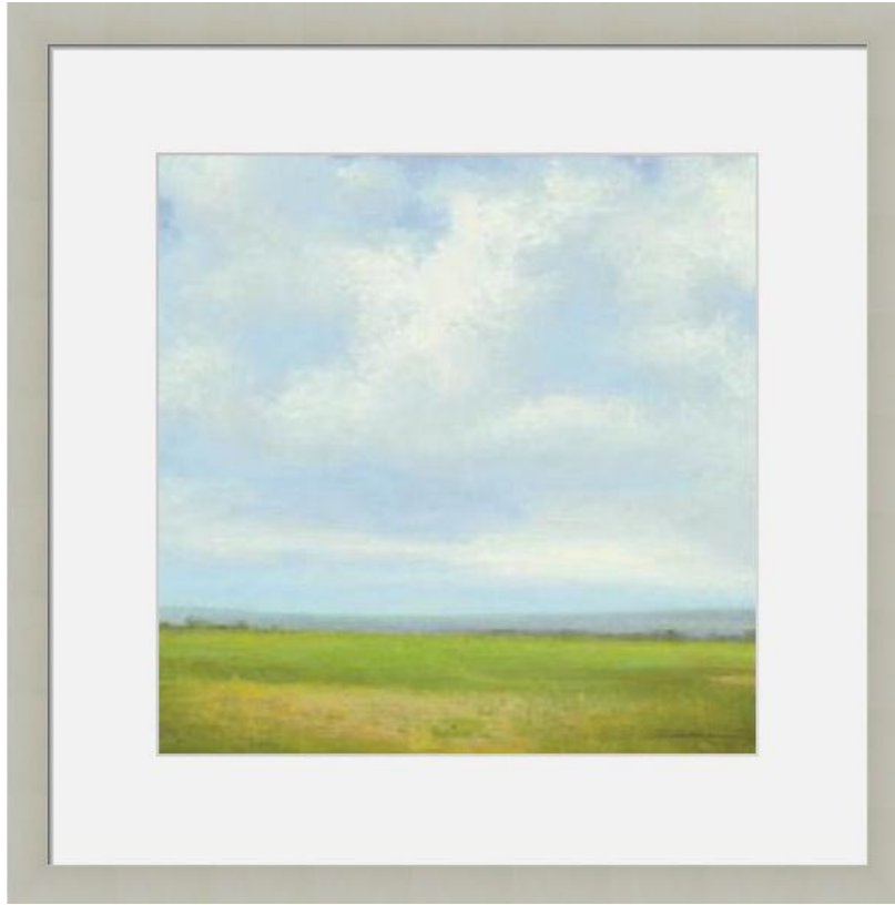
Storm Series I Size: 20w x 20h