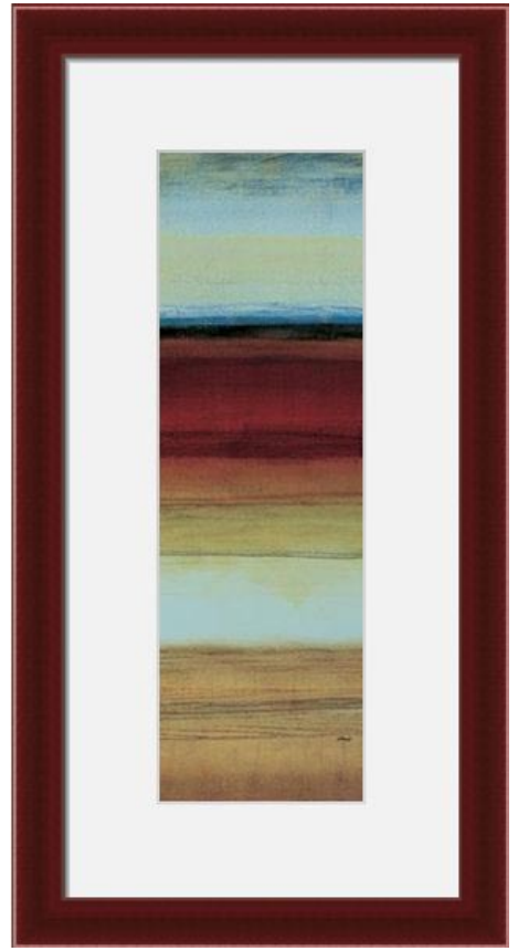
Color Shift III Size: 18w x 40h

1266 East Main Street, Suite 700 Stamford, CT 06902 Ph : 203-977-8203 Fx: 203-274-8817