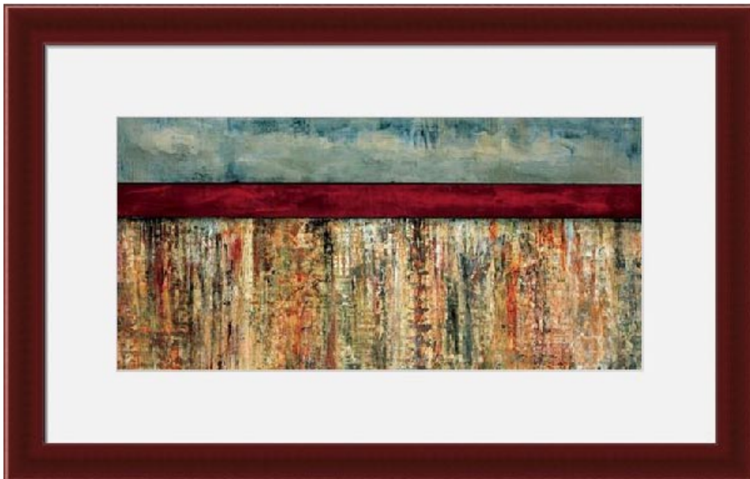
Color Shift Size: 46w x 28h

1266 East Main Street, Suite 700 Stamford, CT 06902 Ph : 203-977-8203 Fx: 203-274-8817