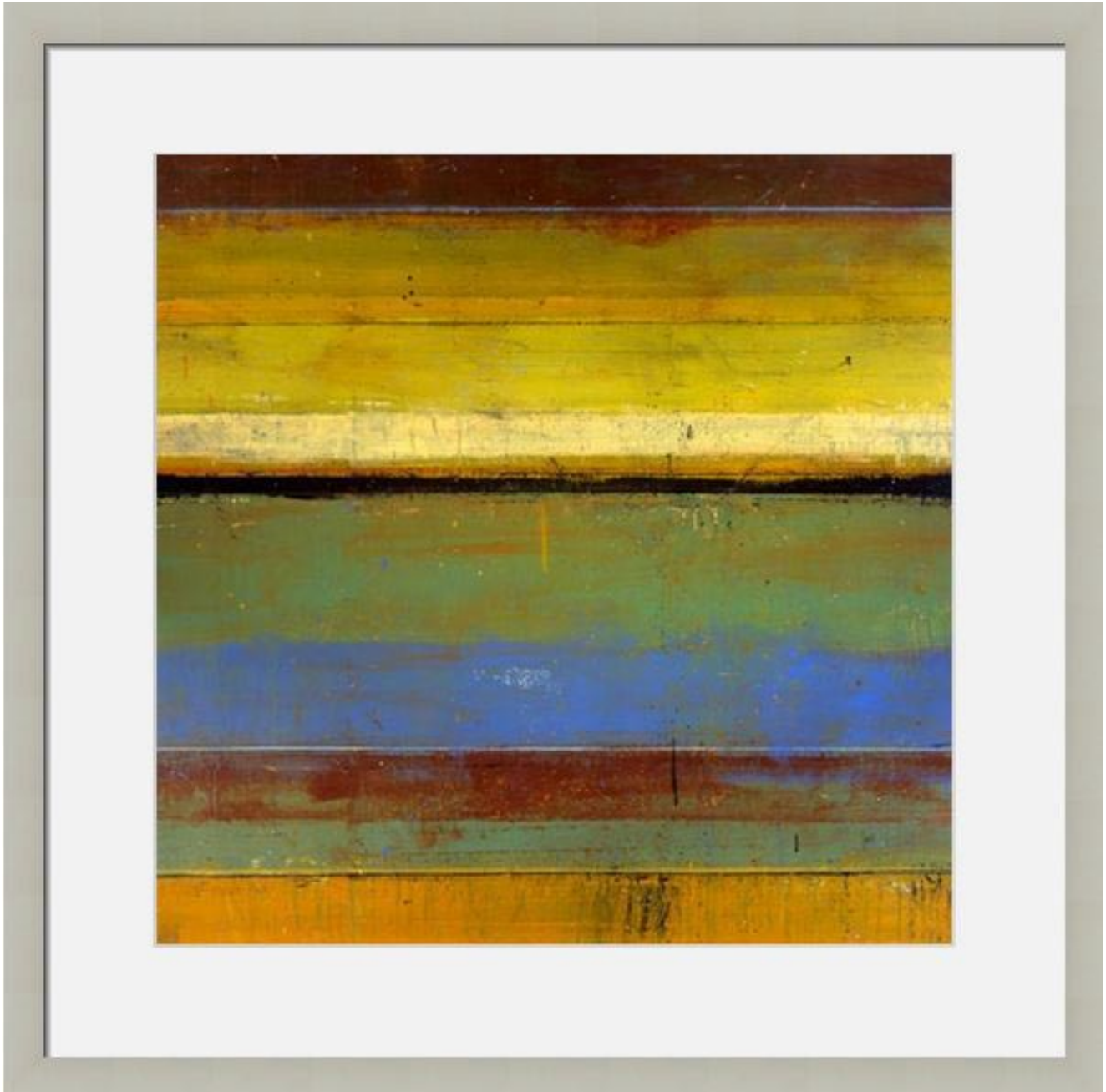
Fresco (Limited Edition)