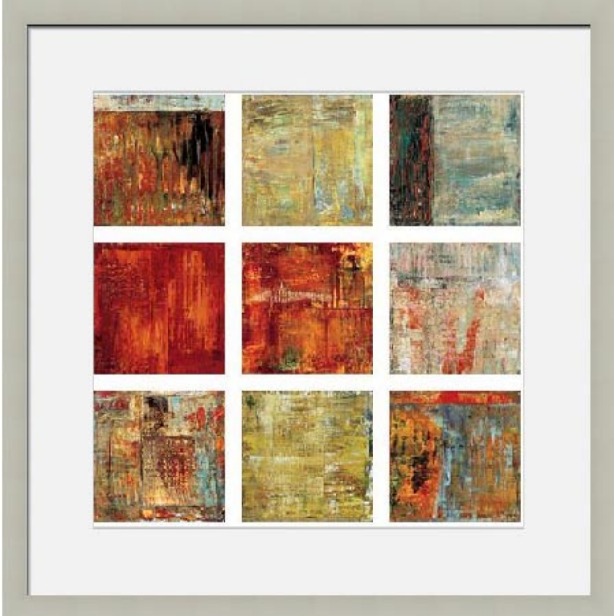
Remnants Size: 38w x 38h