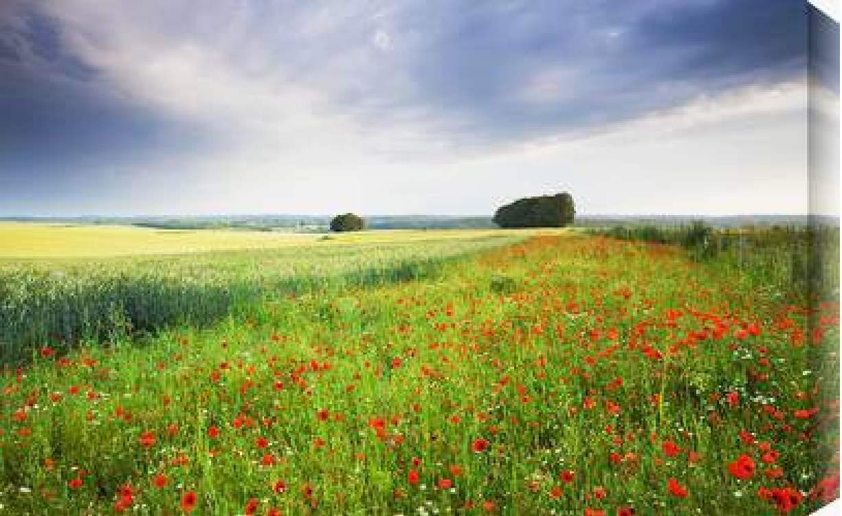
Tulip Field Canvas Size: 65w x 44h