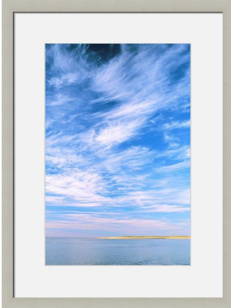
Beach Sunset (Copier-Side Wall) Size: 22w x 34h