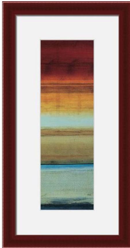
Color Shift II Size: 18w x 40h