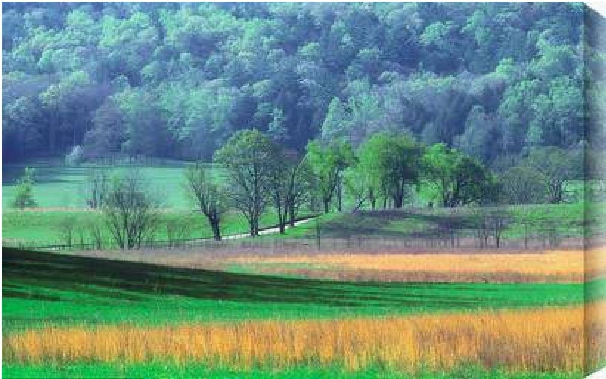
Golden Field Canvas