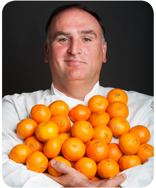
Humanitarian of the Year José Andrés is a leader among philanthropists.

Andrés' solution for feeding many of the island's people? Start with $10,000 of his own money in cash and multiple credit cards that he used to buy food.