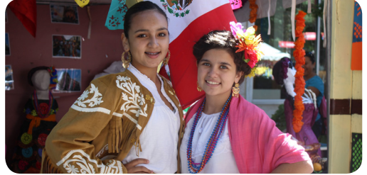
Cultural attire is on display at Hola Charlotte Festival.