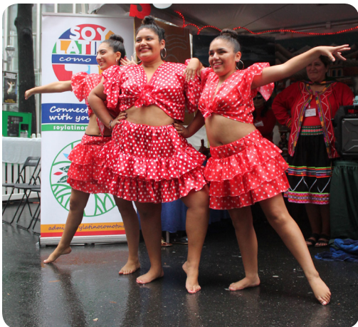
Dancers entertain the crowd at Hola Charlotte Festival.

No fewer than 1,500 marchers participate in this annual event that takes place on the Benjamin Franklin Parkway and features traditional Latino music, poetry and dance.