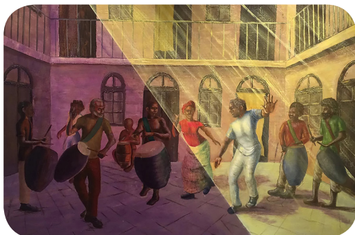
"Candombe at Conventillo" by Claudio Altesor

"Candombe at Conventillo," an oil painting on linen, is a typical courtyard scene of a conventillo (a tenement building of African-Uruguayans) playing candombe.