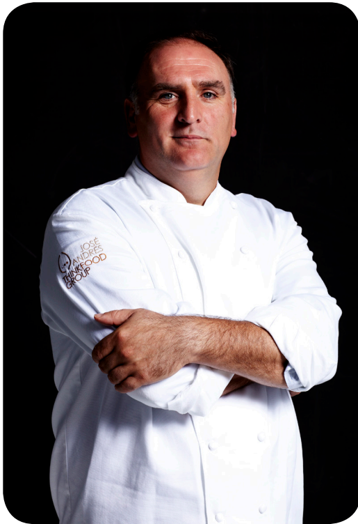
José Andrés operates on an international scale.

Weeks after arriving in Guatemala following the eruption of Fuego Volcano, Andrés and the World Central Kitchen team activated kitchens and food trucks to deliver meals to 30 distribution points. Since partnering with other agencies starting in June 2018, #ChefsForGuatemala had served more 100,000 meals. Andrés and the team delivered meals to Ceilán, which was directly in the impact radius of the volcano.